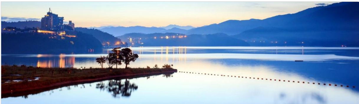
Sun Moon Lake, Taichung, Taiwan