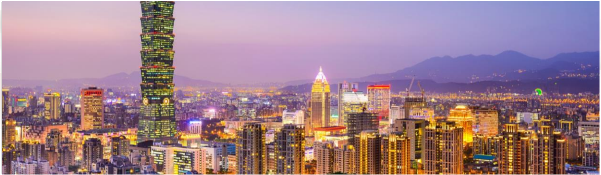
An overview of Taipei city, Taiwan