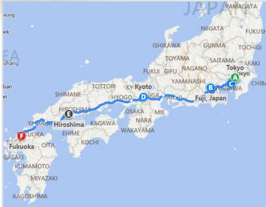
Tokyo – Fuji – Yokohama – Kyoto – Hiroshima - Fukuoka