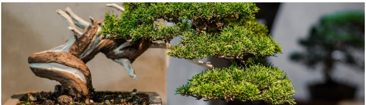
Artistic display of Bonsai making, Shunkaen Bonsai Museum, Tokyo Japan