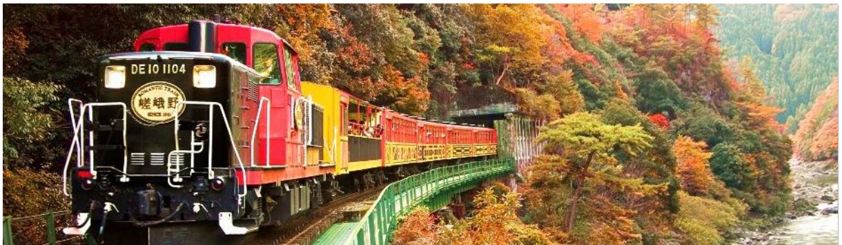
Sagano Torokko Scenic Railway, Kyoto, Japan