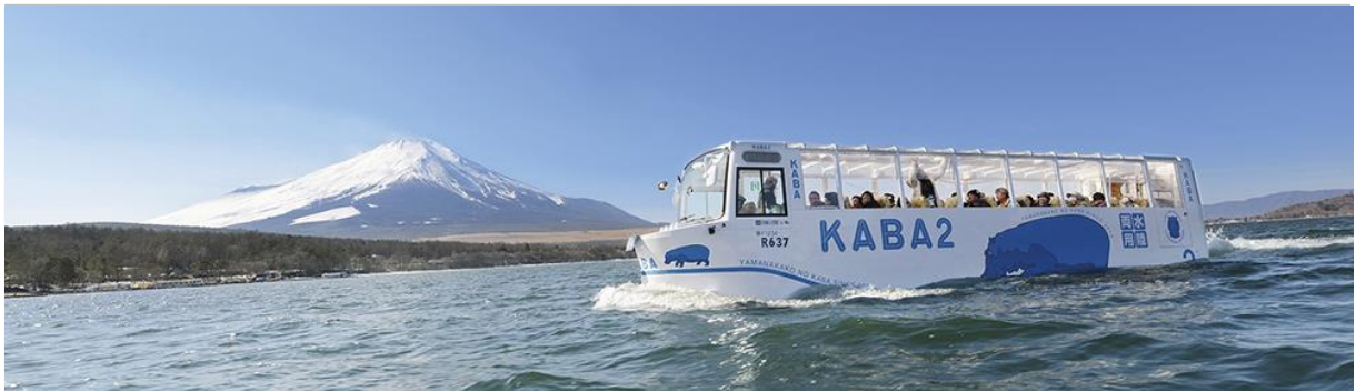
Amphibious bus through the Yamanaka Lake, Japan