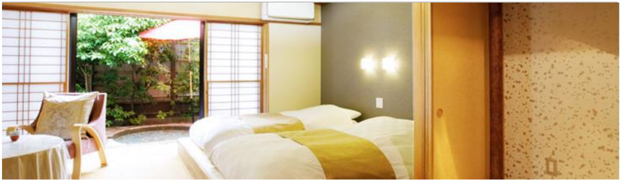
Standard Japanese Style Room at Fuji Onsenji, Fuji, Japan