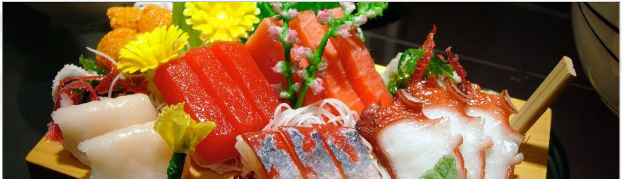
A sashimi replica at Replica Food-making Workshop, Tokyo, Japan