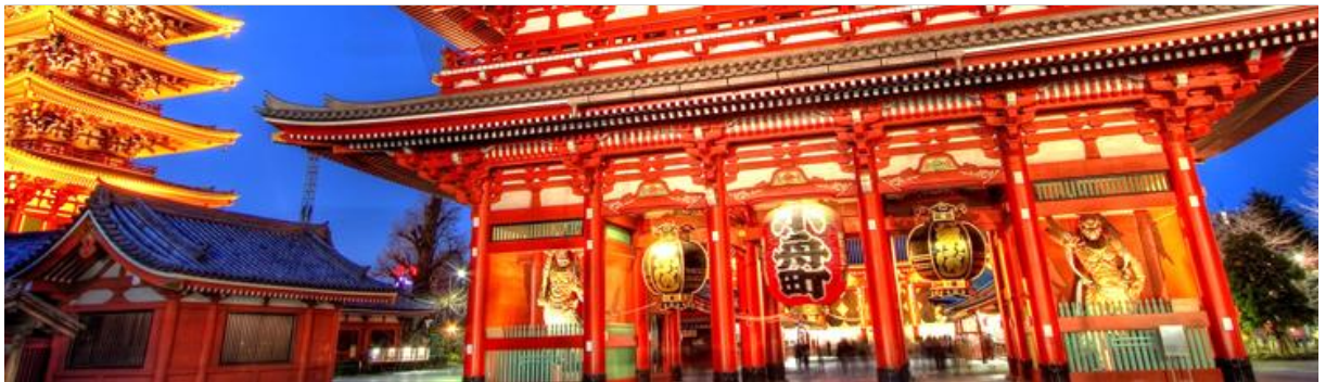
Entrance of Senso-ji, Tokyo, Japan