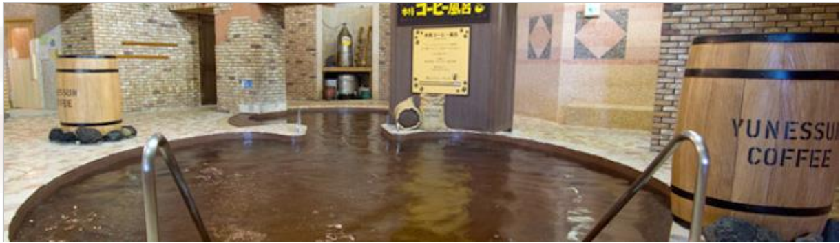
Coffee Bath at Hakone Kowakien Yunessun, Hakone, Japan