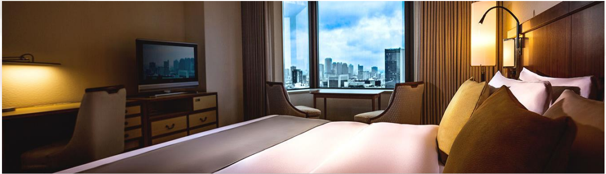
Standard Single Room at Imperial Hotel Tokyo, Tokyo, Japan